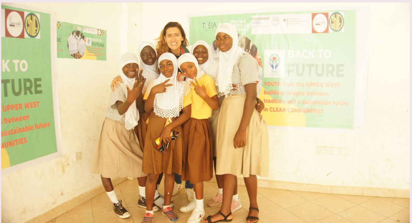
Back To The Future THEIA Program in GHANA West Africa