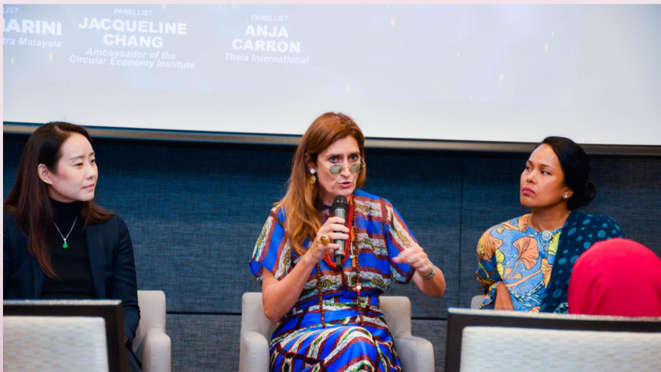
Malaysia’s First Sustainable Fashion Forum