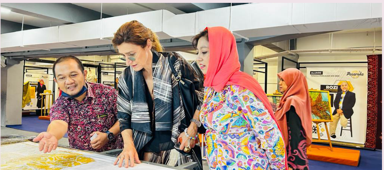
First Sustainable Fashion and Handcraft Show Malaysia

“...leaderships’ real task is to create the conditions in which diverse people, perspectives, and capabilities can contribute meaningfully and carry responsibility.”